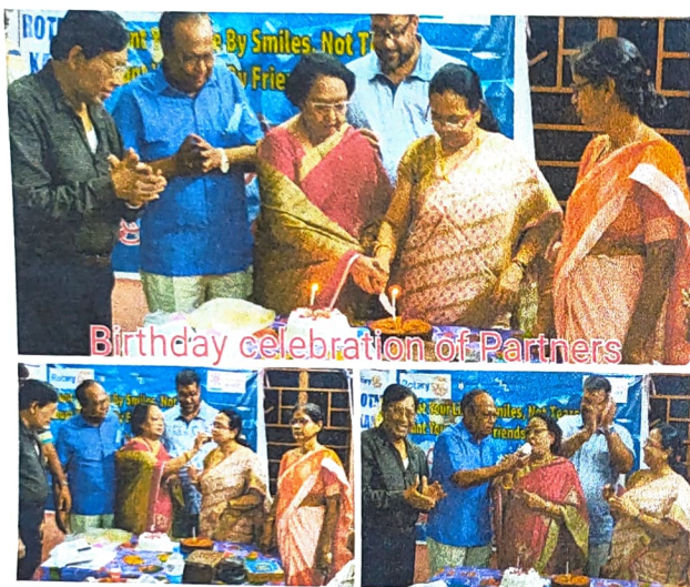
Birthday celebration of Partners